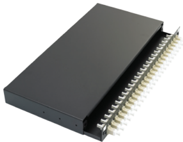
A. Sliding drawer design

The Excel range of LC patch panels are sliding drawer 'tray style' housings suitable for either direct termination or splicing of upto 48 fibres in 1U of rack space. Each panel is manufactured from high quality 2mm thick steel and finished in Black powder coated paint to provide a strong and durable unit. To the front of the patch panel the specified number of duplex adaptors are loaded from left to right. The facia also houses the release latches for the sliding drawer. Each panels utilises colour coded adaptors, Beige for multimode, Blue for singlemode. Each duplex adaptor accommodates two terminated fibres. Each panel has included within it a set of adjustable fixingarms, and a cable management pack which includes cable entry glands, cable ties, and a 24 way splice bridge.