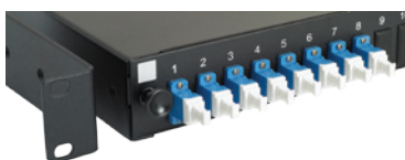
C. Adjustable fixing arms. clear port and panel labelling