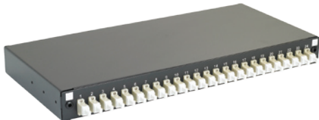
B. Panels are available part or fully loaded