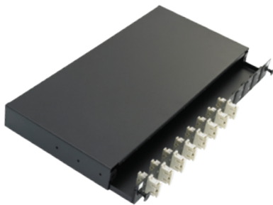
A. Sliding drawer design

The Excel range of SC patch panels are sliding drawer 'tray style' housings suitable for either direct termination or splicing of upto 48 fibres in 1U of rack space. Each panel is manufactured from high quality 2mm thick steel and finished in Black powder coated paint to provide a strong and durable unit. To the front of the patch panel the specified number of duplex adaptors are loaded from left to right. The facia also houses the release latches for the sliding drawer. Each panels utilises colour coded adaptors, Beige for multimode, Blue for singlemode. Each duplex adaptor accommodates two terminated fibres. Each panel has included within it a set of adjustable fixing arms, and a cable management pack which includes cable entry glands, cable ties, and a 24 way splice bridge.