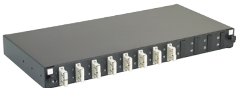
B. Part loaded panels allow for expansion