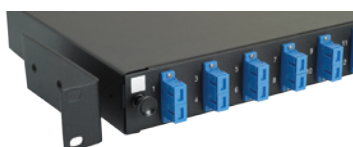
C. Adjustable fixing arms, clear port and panel labelling