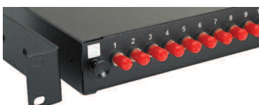
C. Adjustable fixing arms, clear port and panel labelling