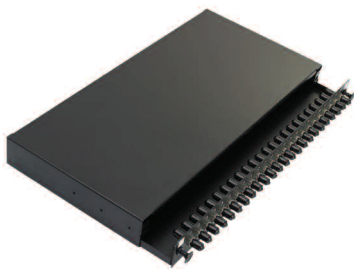
A. Sliding drawer design

The Excel range of ST patch panels are sliding drawer 'tray style' housings suitable for either direct termination or splicing of upto 24 fibres in 1U of rack space. Each panel is manufactured from high quality 2mm thick steel and finished in Black powder coated paint to provide a strong and durable unit. To the front of the patch panel the specified number of simplex adaptors are loaded from left to right. The fascia also houses the release latches for the sliding drawer. Each adaptor is fitted with a colour coded dust cap, Black for multimode, Red for singlemode. Each simplex adaptor accommodates one terminated fibre. Each panel has included within it a set of adjustable fixing arms, and a cable management pack which includes cable entry glands, cable ties, and a 24 way splice bridge.