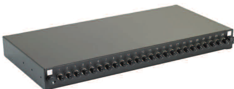
B. Panels are available part or fully loaded