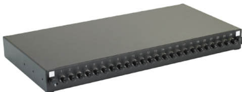
B. Panels are available part or fully loaded