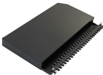
A. Sliding drawer design

The Excel range of ST patch panels are sliding drawer ‘tray style’ housings suitable for either direct termination or splicing of upto 24 fibres in 1U of rack space. Each panel is manufactured from high quality 2mm thick steel and finished in Black powder coated paint to provide a strong and durable unit. To the front of the patch panel the specified number of simplex adaptors are loaded from left to right. The fascia also houses the release latches for the sliding drawer. Each adaptor is fitted with a colour coded dust cap, Black for multimode, Red for singlemode. Each simplex adaptor accommodates one terminated fibre. Each panel has included within it a set of adjustable fixing arms, and a cable management pack which includes cable entry glands, cable ties, and a 24 way splice bridge.