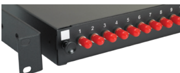
C. Adjustable fixing arms. clear port and panel labelling