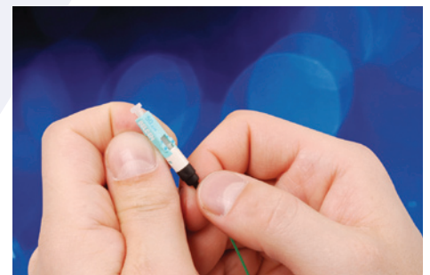
3. Slide the boot on the connector body

That's it! You have effectively accomplished the splicing and crimping of the fibre in about five seconds. The activator performs the fibre splicing and crimping action within the connector, reducing the number of steps involved by 50% (in comparison to most field-installable connectors in the market today). Additionally, the connector can be re-terminated up to five times – which means that the installer can re-open the activator mechanism, remove the un-terminated fibre from the connector and repeat the installation procedure up to five times – making the installer's success ratio virtually 100%.