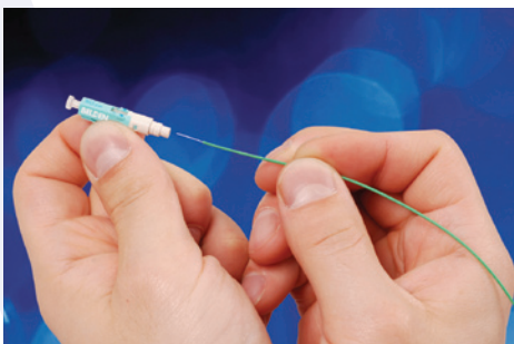
1. Insert the fibre into the connector

Once you have prepared the tight buffered fibre for installation into the connector, you simply perform the following three steps to terminate the fibre: